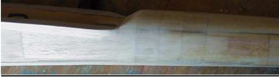
This shows a spiral reinforcing wrap of nylon tape & the full tripler of 1/16" balsa between 1/8" balsa doublers.