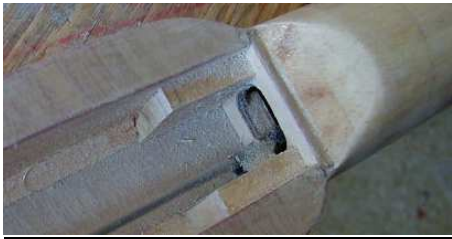
This shows F2, the deep rails and the saddle capped with 1/64" ply strips. The HS tubing covered end of the pushrod tube has been secured to F2 with a drop of instant CA glue and then coated with a fillet of silicone sealer so it is firmly attached there.