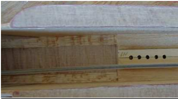
This shows front of the saddle caps and the interior portion of the towhook blocking. 1/2" triangular stock on either side secures it to the SS's & the 1/16" ply plate across the bottom of the fuselage. To keep spray paint off the pushrod it has been covered with a piece of tubing. Masking tape goes inside, too, before painting so good glue joints can be made when installing the main bolt holddown unit.