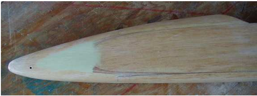
Close up makes nose look stubby. Note how the nose block, sides, closed compartment & fuse bottom all merge together for nice appearance. Icing putty fills beyond where sides end. Hole is where 1/8" dowel goes through to secure the nose tooth.