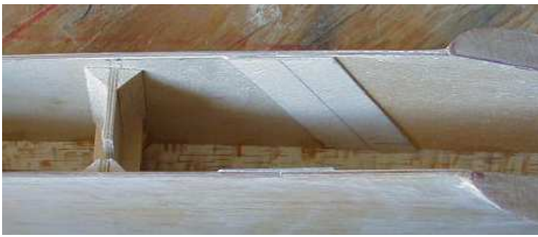
F1 and the 1/32" ply splices that join front & rear SS sections are shown here. The steep angle leaves room for servo mounting side rails behind F1 and clearance for the 1" x 4" side plates of the main bolt holddown unit.